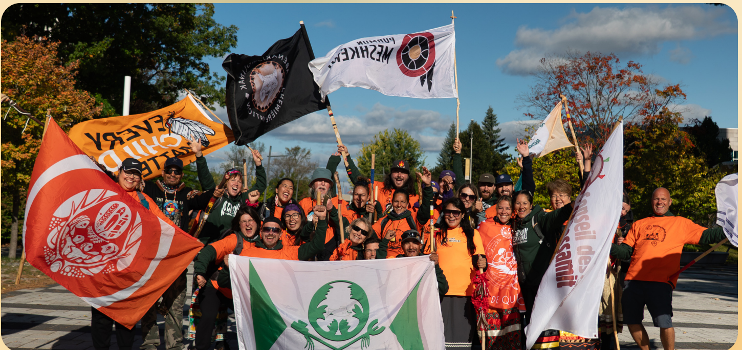
Mamu Nikantetau Expedition - 2025 Edition

For any information requests : info@puamun.com