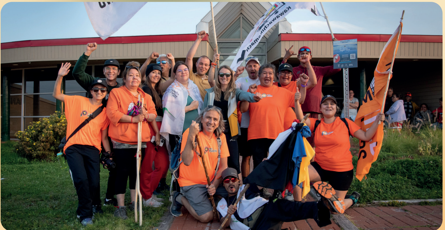
Uashat mak Mani-Utenam, Mamu Nikantetau - 2023 Edition

For any inquiries, please contact: info@puamun.com