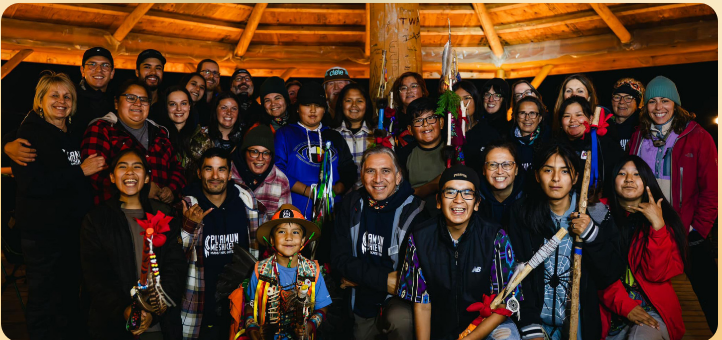
Lac Simon, Mamu Nikantetau - 2024 Edition